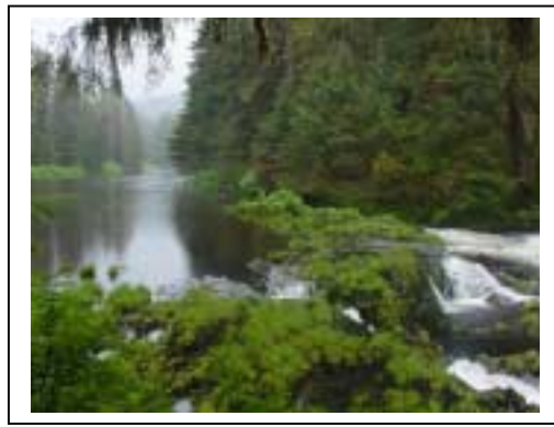
Waterfall, Naha River

For information call Ernesta Ballard: 907.247.0846 bandaktn@ptialaska.net