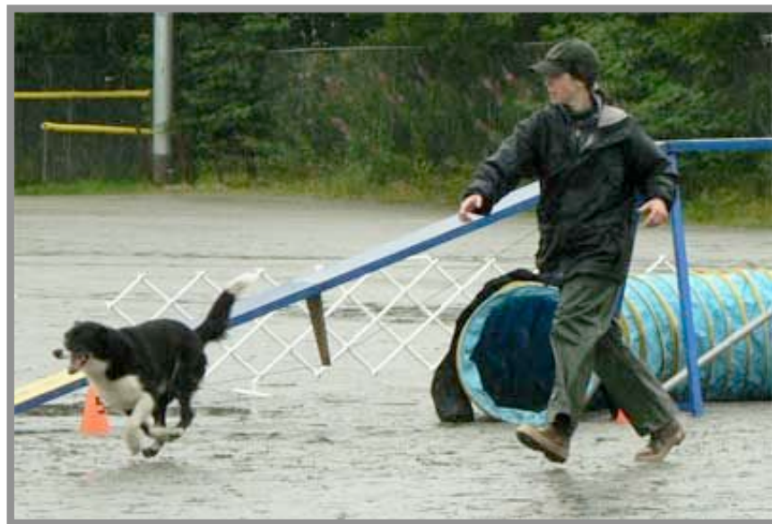
August 2006 Agility Trial Photos